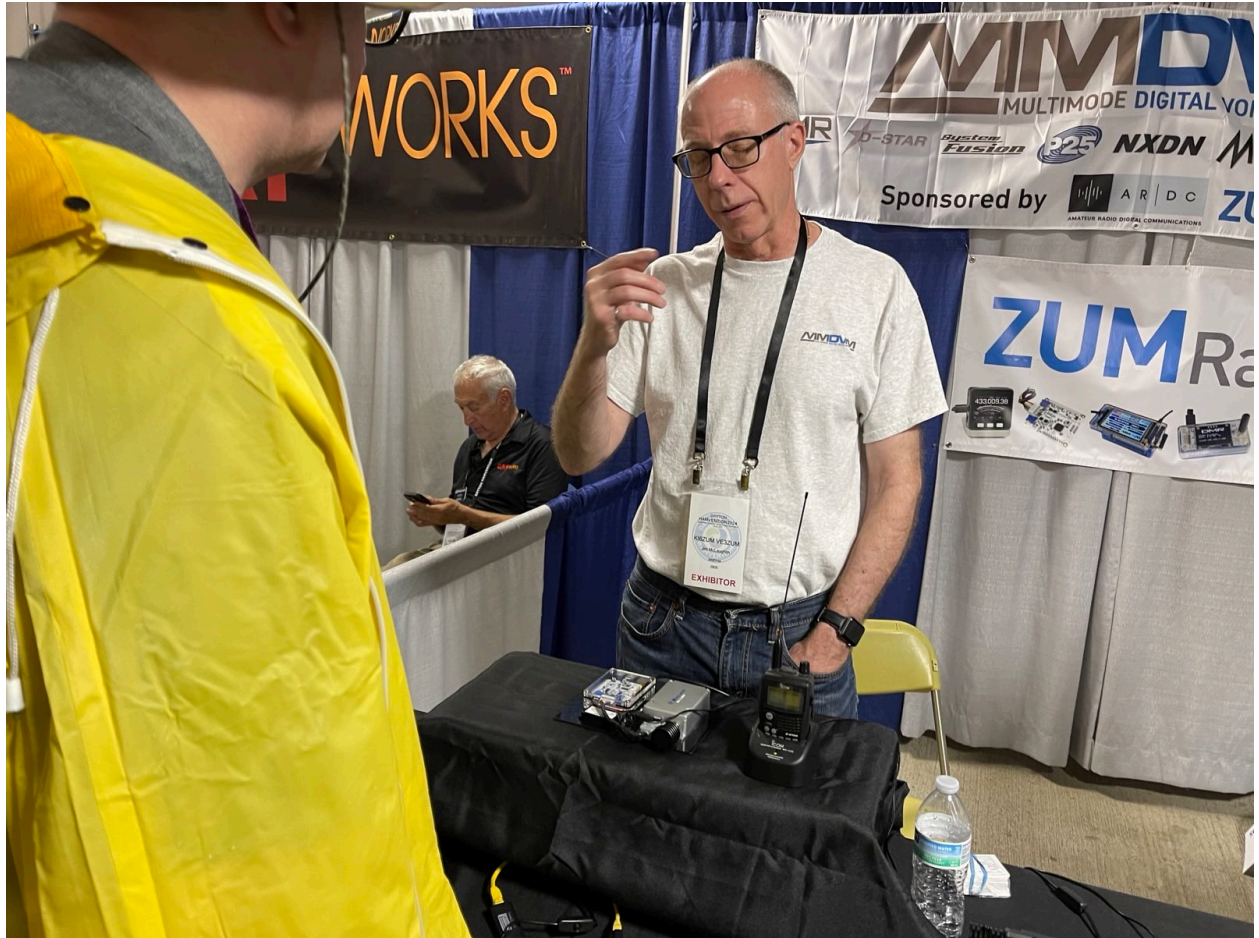
Picture 12 Zum radio booth