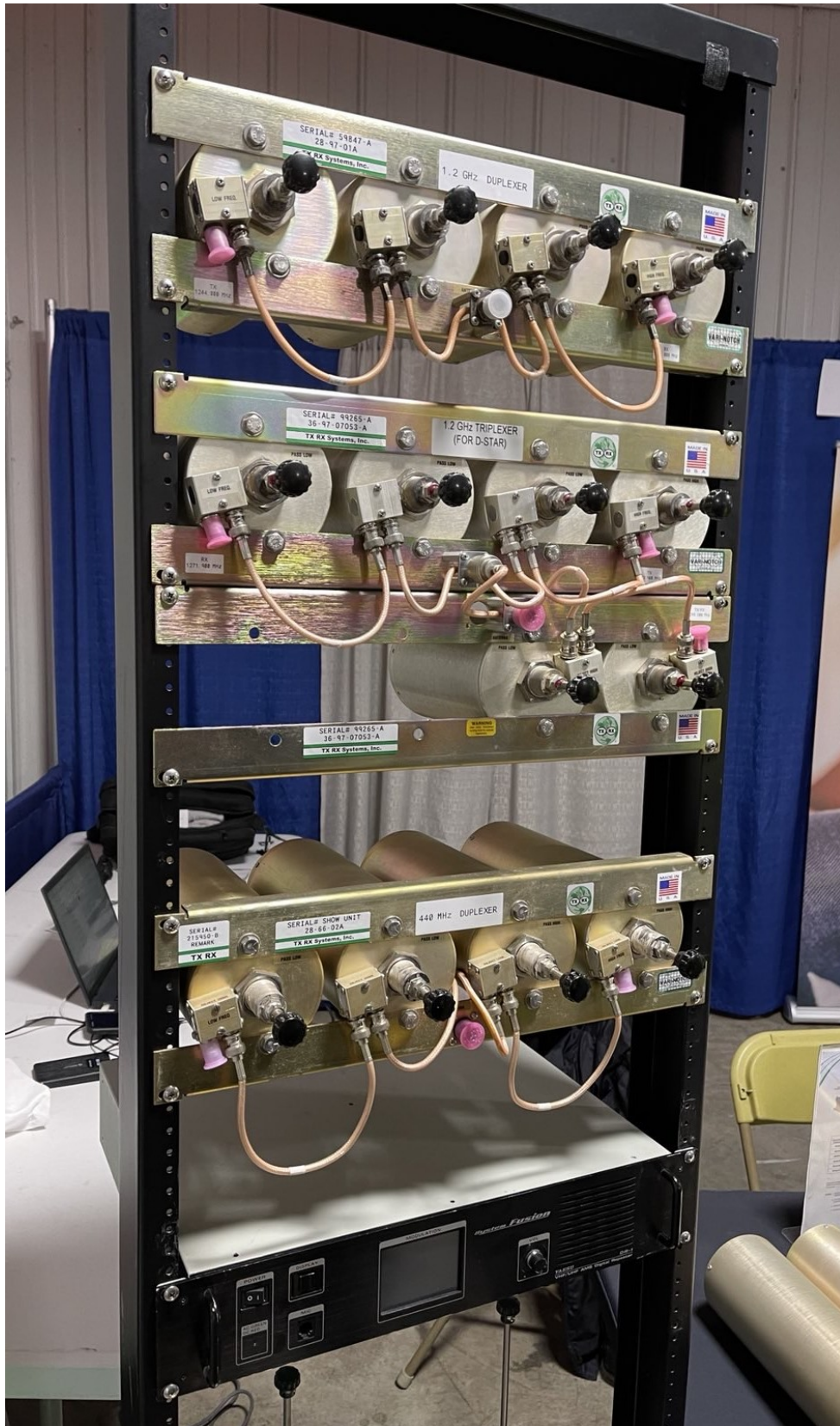
Picture 4 & 5 TXRX Booth