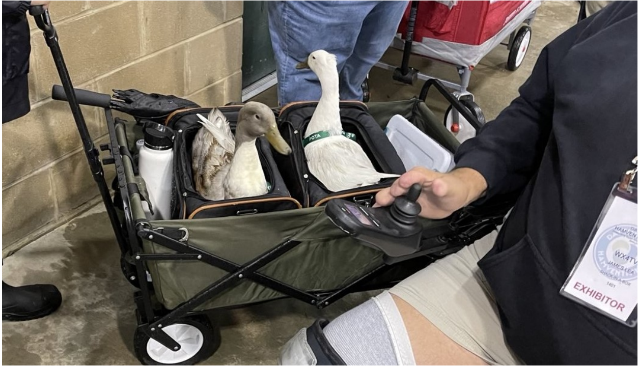
Picture 6 it was raining so hard even the ducks made their way inside