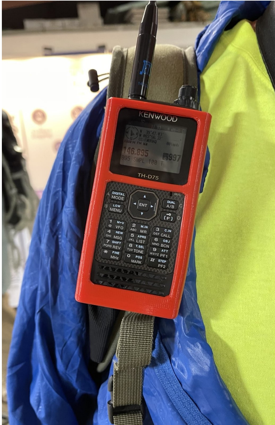
Picture 13 Kenwood TH-D75A with Etsy case