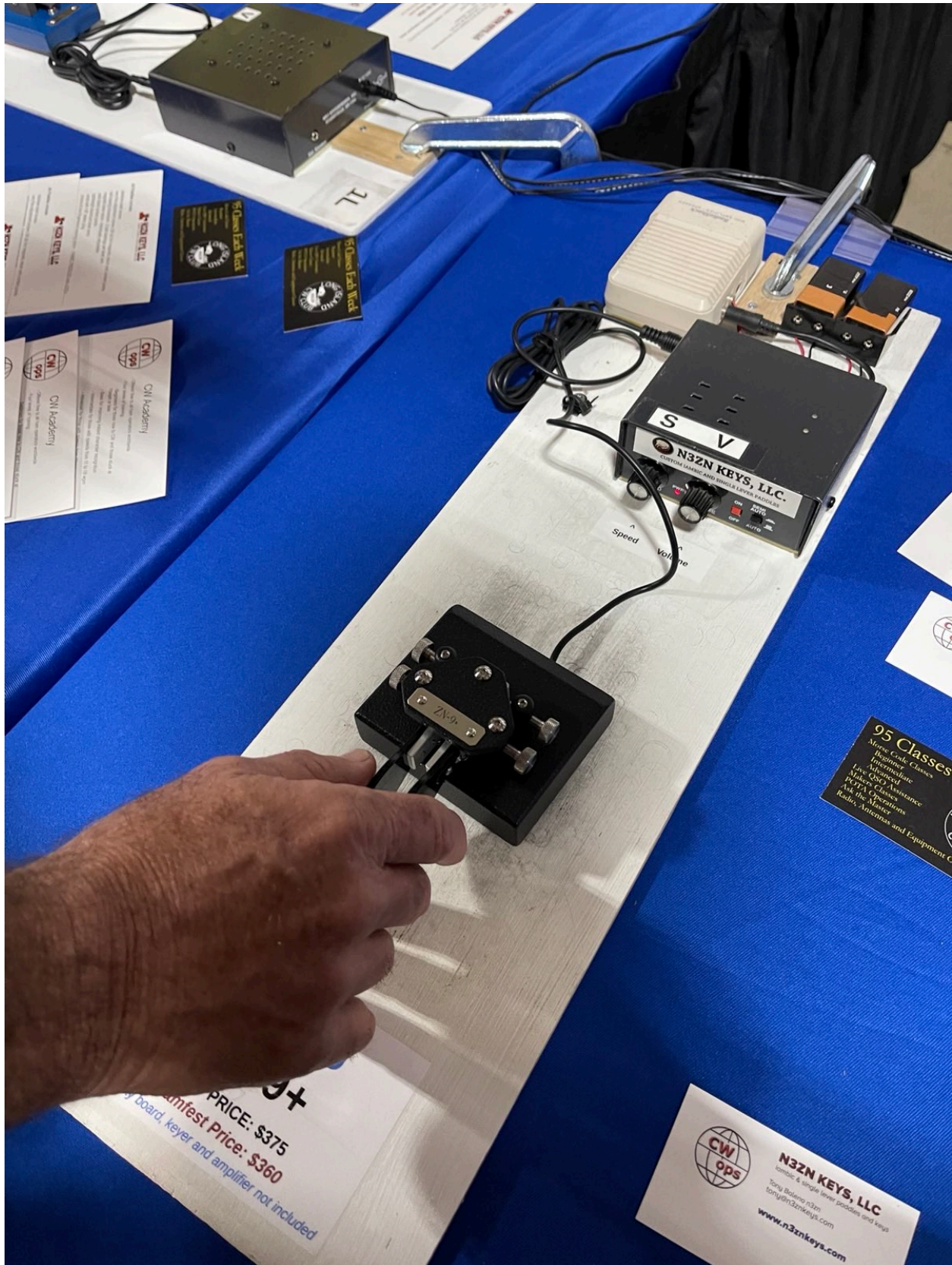
Picture 9, 10 N3ZN CW Keys booth