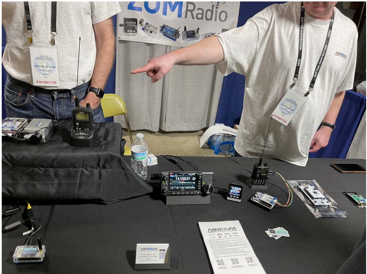
Picture 11 Zum radio booth