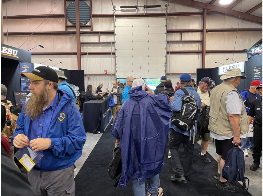
Picture 2 & 3 Yaesu Booth