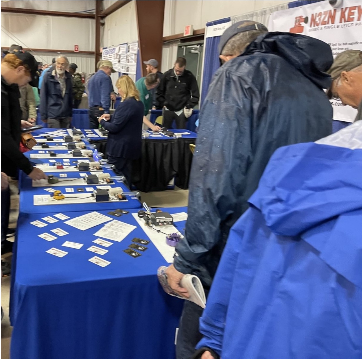
Picture 9, 10 N3ZN CW Keys booth