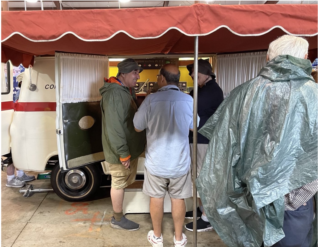
Picture 7 Collins 1964 communications van