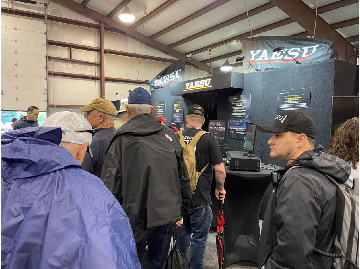
Picture 2 & 3 Yaesu Booth