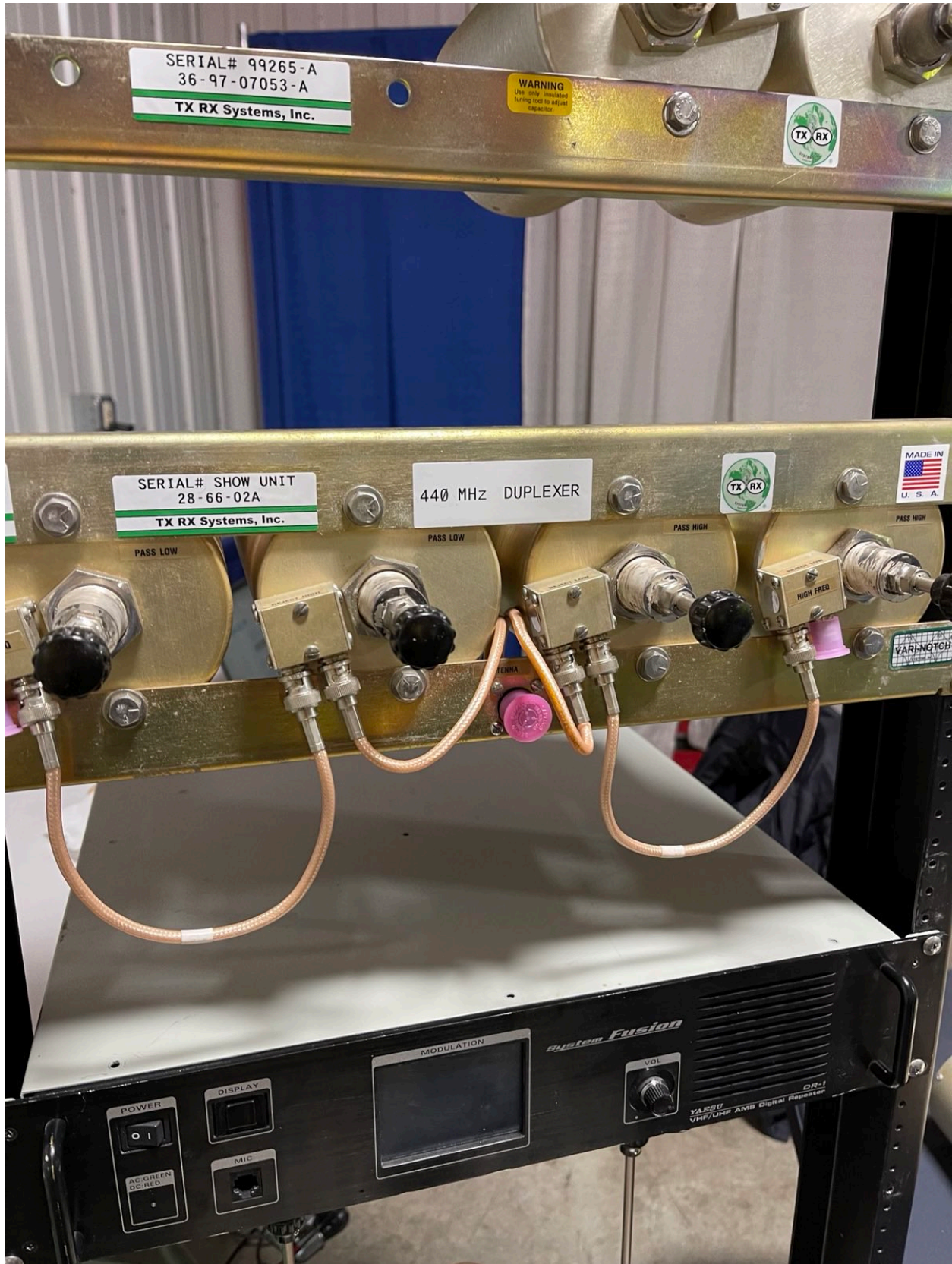
Picture 4 & 5 TXRX Booth